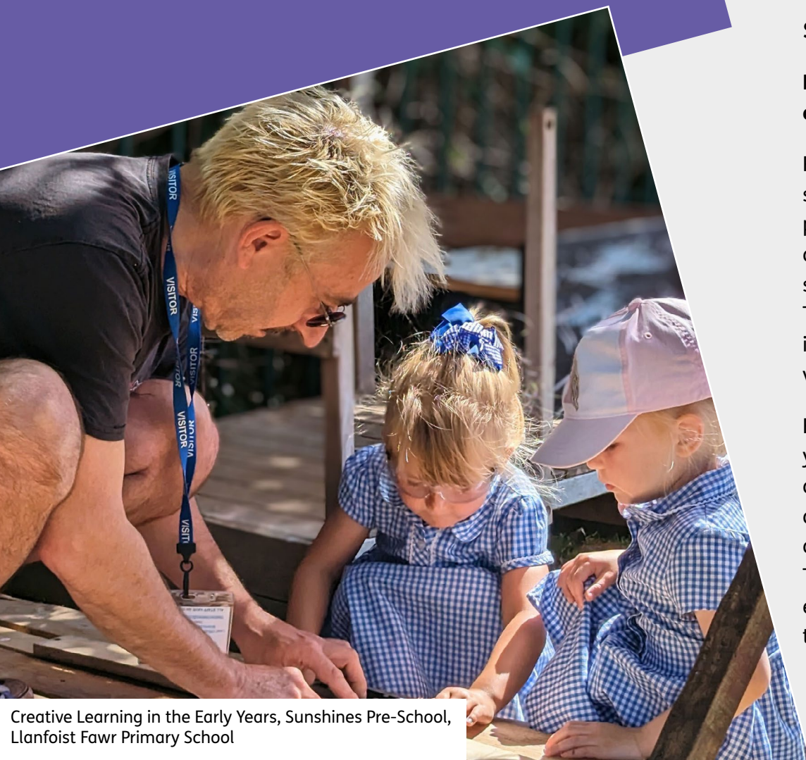
Creative Learning in the Early Years, Sunshines Pre-School, Llanfoist Fawr Primary School