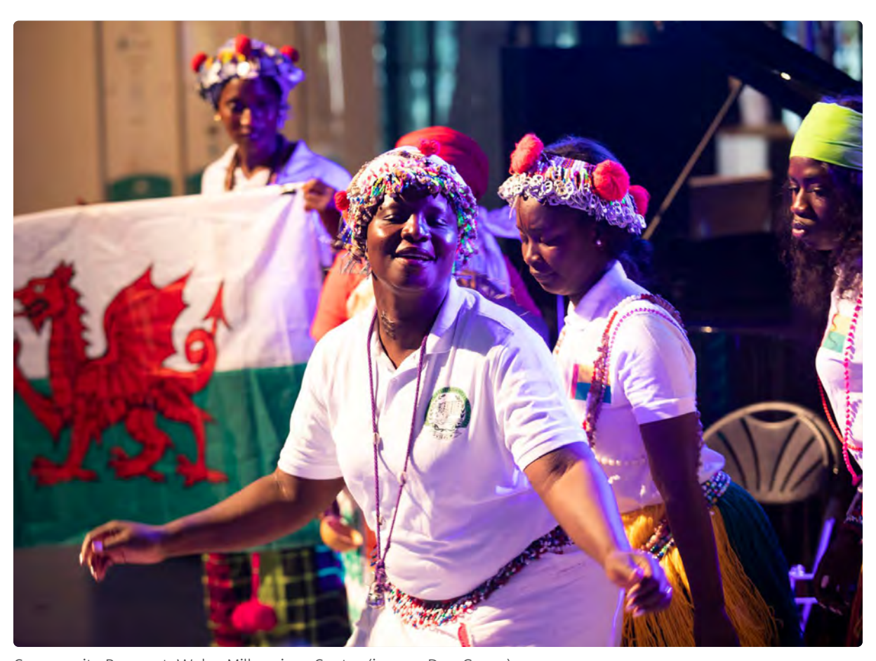
Community Banquet, Wales Millennium Centre

The Welsh Government's expectations of us are set out in the annual <u>Remit Letter</u>. Given the unexpected implications of the Coronavirus/COVID 19 pandemic, the Remit Letter for 2020/21 takes a different form. It has been replaced for this year with a business planning letter setting out anticipated levels of funding for the year. These are delivered through Council's corporate objectives.