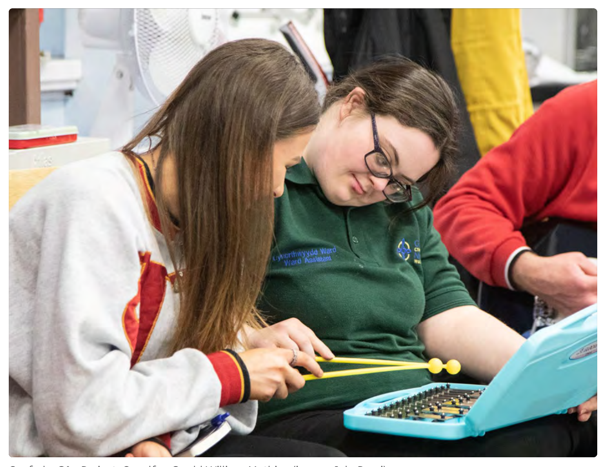
Canfod y Gân Project, Canolfan Gerdd William Mathias

Currently, each revenue-funded organisation enters into a funding agreement for a term of one year with the option to renew for up to five years (subject to annual review). Annual funding agreements set out the anticipated level of funding, the programme of activity to be delivered and the process for monitoring our funding.