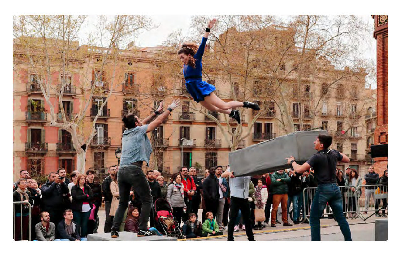
Our key programmes of work in 2020/21