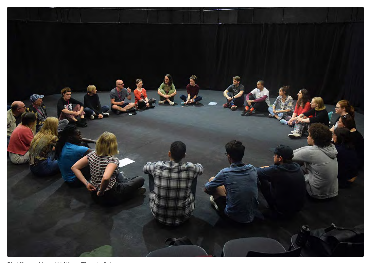
Platfform New Writing, Theatr Iolo

These are key aspects of our arts development mission. But it's a mission that comes under stress when resources tighten.