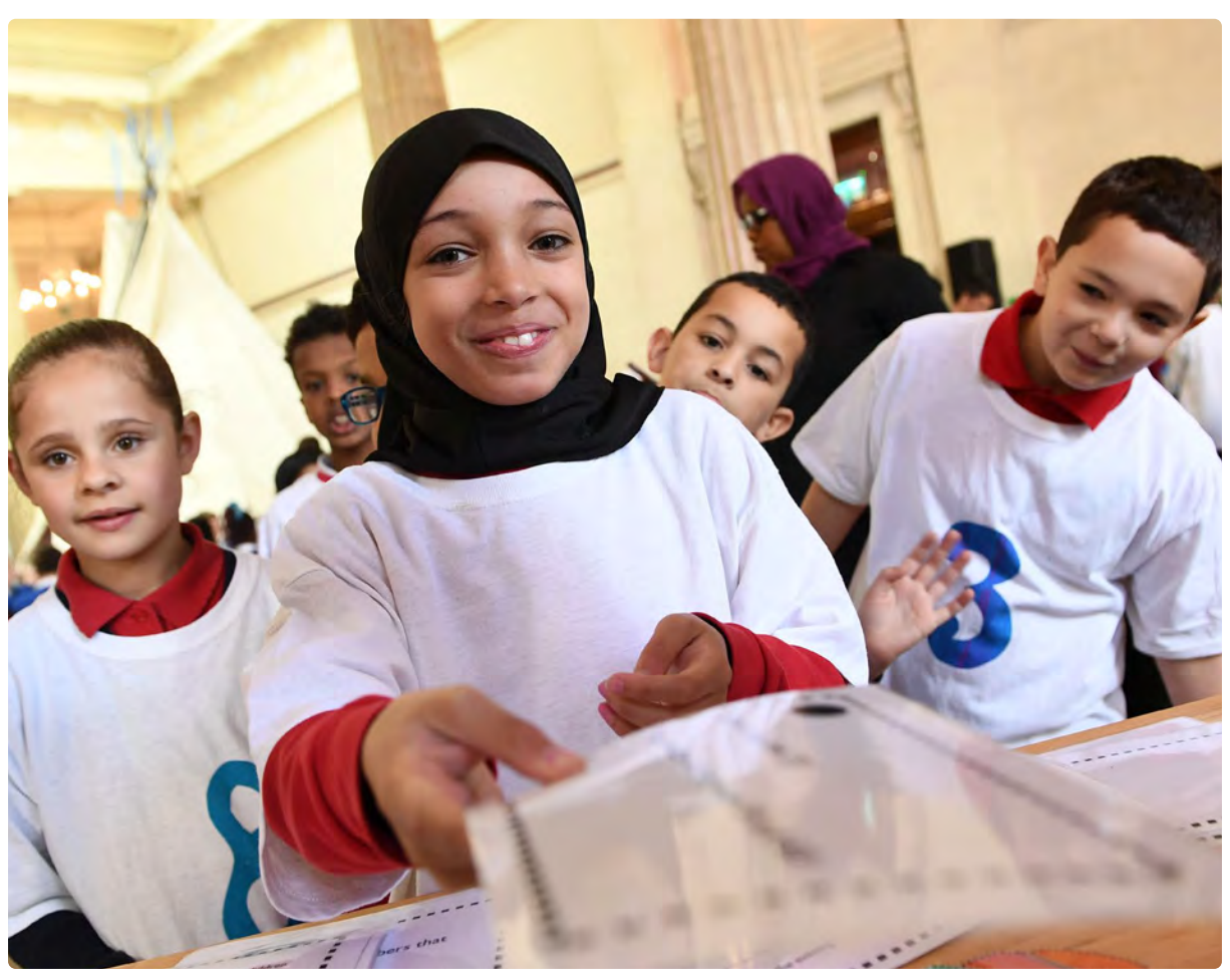
Let's Celebrate event, Creative learning through the arts

We're equally interested in the marginalised and the ignored – those who for whatever reason have become separated from mainstream training and education and who are in danger of falling between the cracks in the current system.