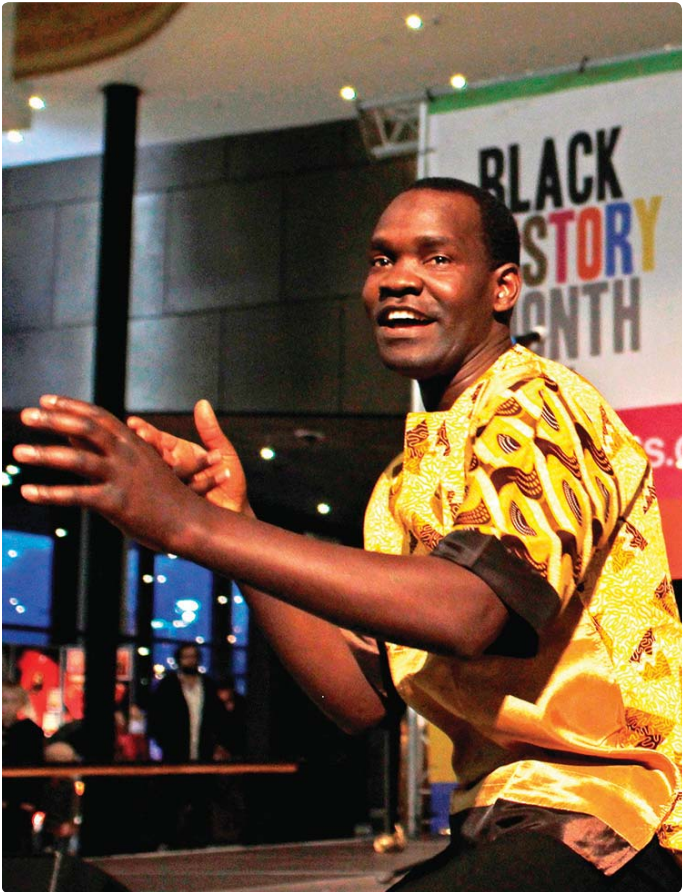
► Black History Month