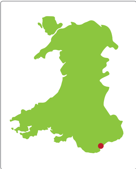
▲ Wales Millennium Centre