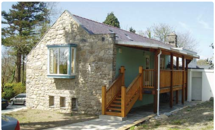
Ty Newydd Writer's Centre