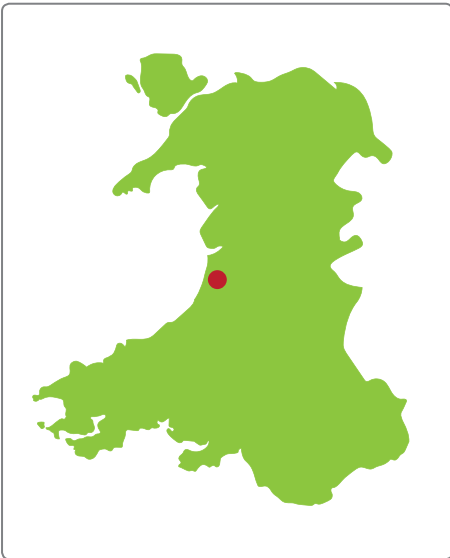
Aberystwyth Arts Centre