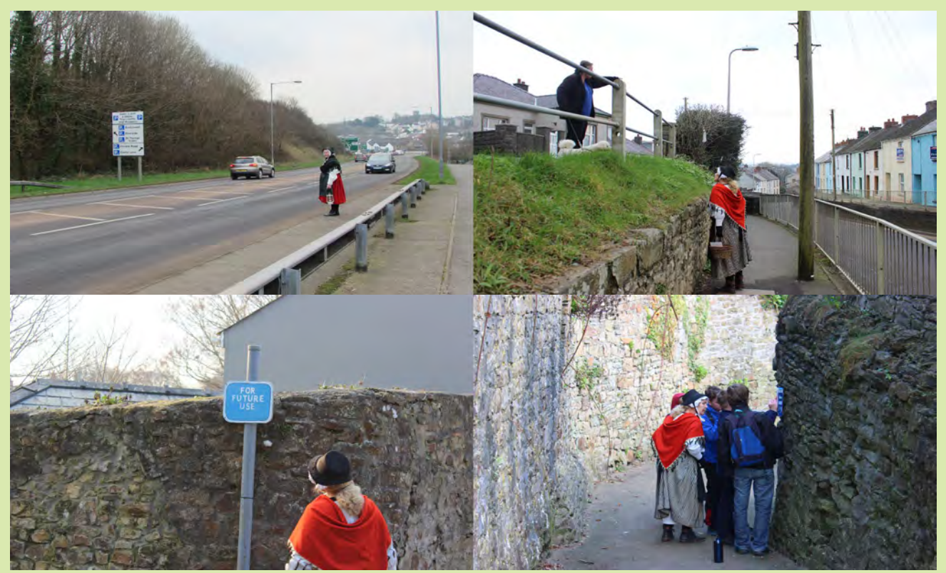
'Searching for the Centre' by artist Janetka Platun saw four women dressed as tradtional Llangwm fisherwomen enter Haverfordwest at different points and through asking the public for guidance hunt for the centre of the town

Echoing this sentiment, IPP privileges the journey... before formulas get articulated — to counter the trend of places becoming less like themselves and more generic — and to grow places which are an expression of the people who live and work in them. Not imposing an aesthetic, but to discover and share what is authentic and what resonates with people; what is valued, and what should be valued.