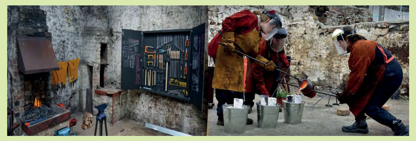
As part of the STAMP project, at the historic and derelict site Cei Llechi (Slate Quay) in Caernarfon, the old forge was reinstated to create a temporary community forge and focal point for testing and discussing future uses of the site.

IPP aimed to and — we believe — succeeded in creating the conditions whereby the intervention of the individual artist/artists in partnership with community activists and residents could gain significantly more traction. IPP wanted to explore and fashion situations where the artist in collaboration with communities and organisational partners was centrally involved in all stages of the regeneration and community development process — most importantly from the beginning of the procurement process; finding opportunities at every stage for people, and not just the regeneration professionals, to be part of a process of change never mind, theory. As a result, it is fair to say that across all 7 projects perceptions about the nature of art and the intrinsic role that the artist can play in redefining and articulating the principles of regenerative development have significantly evolved and matured.