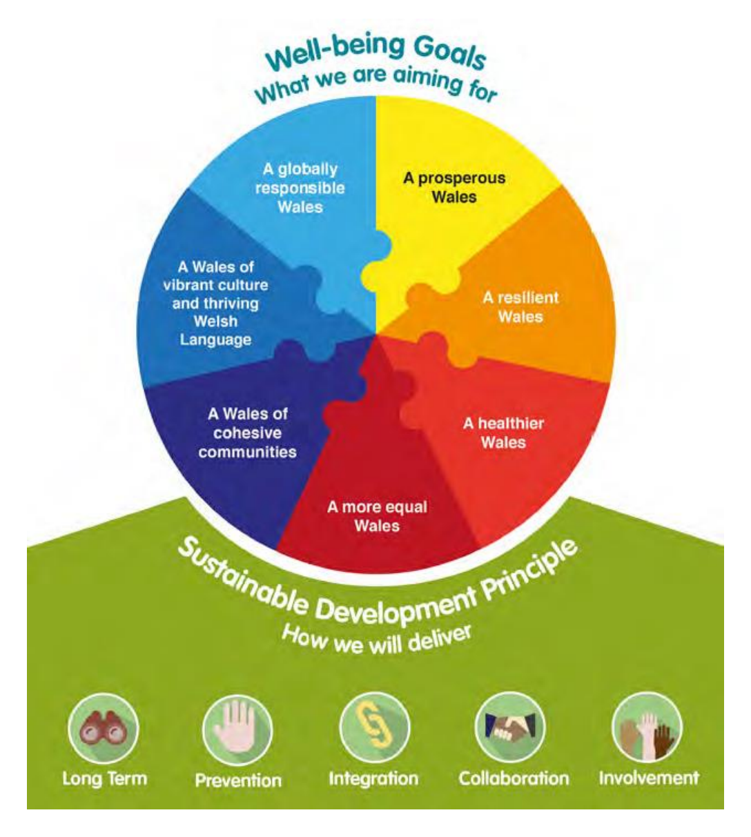
Source - Welsh Government: Shared Purpose: Shared Future - Statutory guidance on the Well-being of Future Generations (Wales) Act 2015

Delivery will be through Public Service Boards (PSB's) and local wellbeing plans for all local authorities in order to improve wellbeing for people and their communities. Public bodies will be expected to contribute to these.