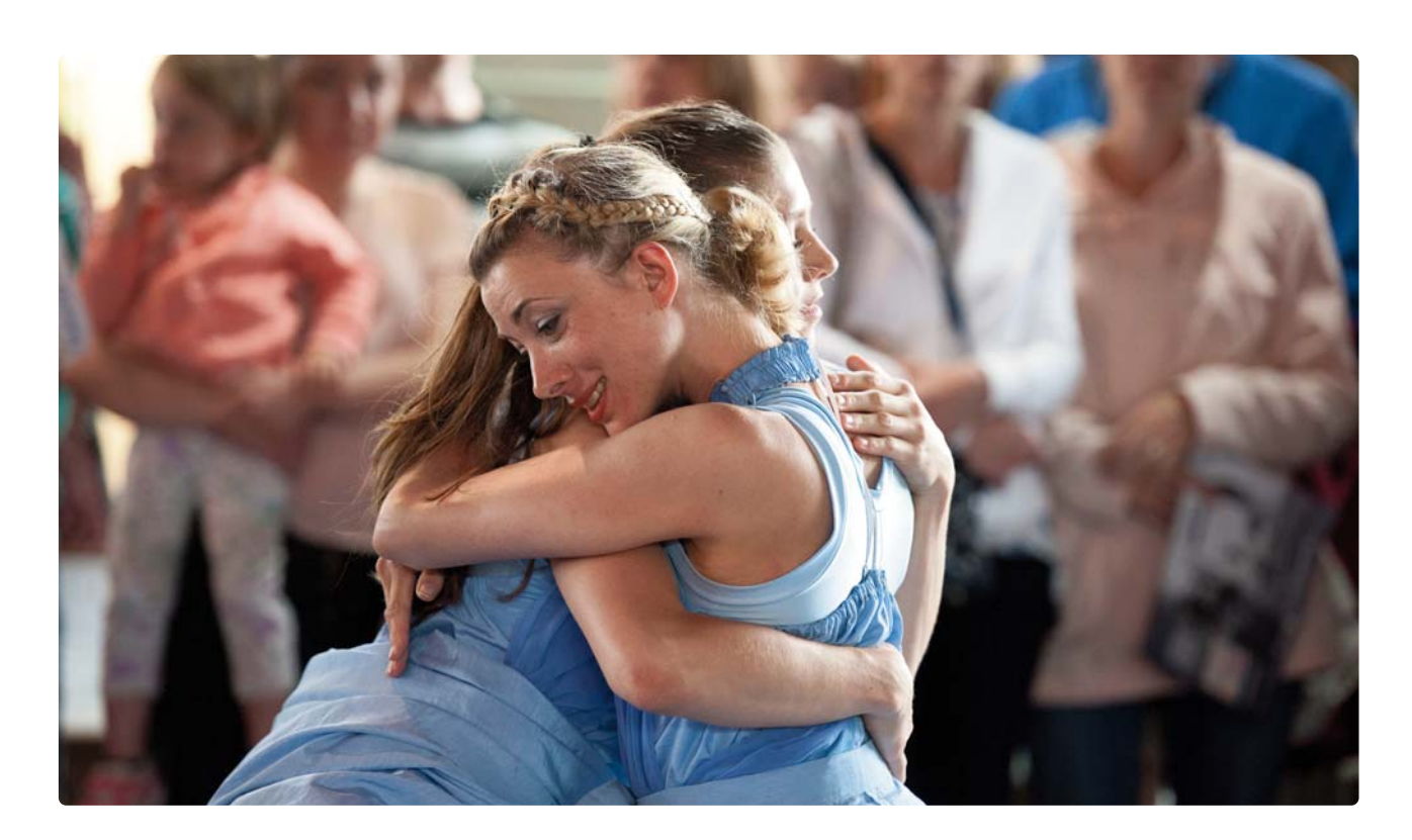
Dance Days, Taliesin Arts Centre

Imagine a Wales with the belief and the appetite, when it's right, to take risks. Not haphazardly or irresponsibly, but knowingly and confidently, equipped with our best instincts, knowledge and expertise. Our civic well being depends on it. Because if we push beyond our comfort zones, with courage and curiosity, we might just bring into sharper focus a future for ourselves that is different, challenging, and perhaps even transformational.