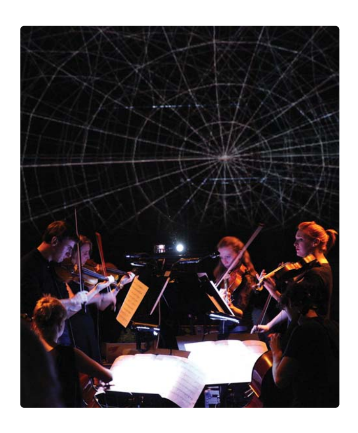
Sinfonia Cymru at Bristol Proms 2014

Email: info@artscouncilofwales.org.uk Website: www.artscouncilofwales.org.uk