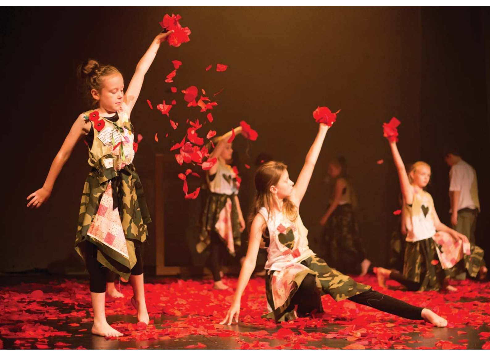
The Stories We Carry, Performing Arts for Kids, Artis Community