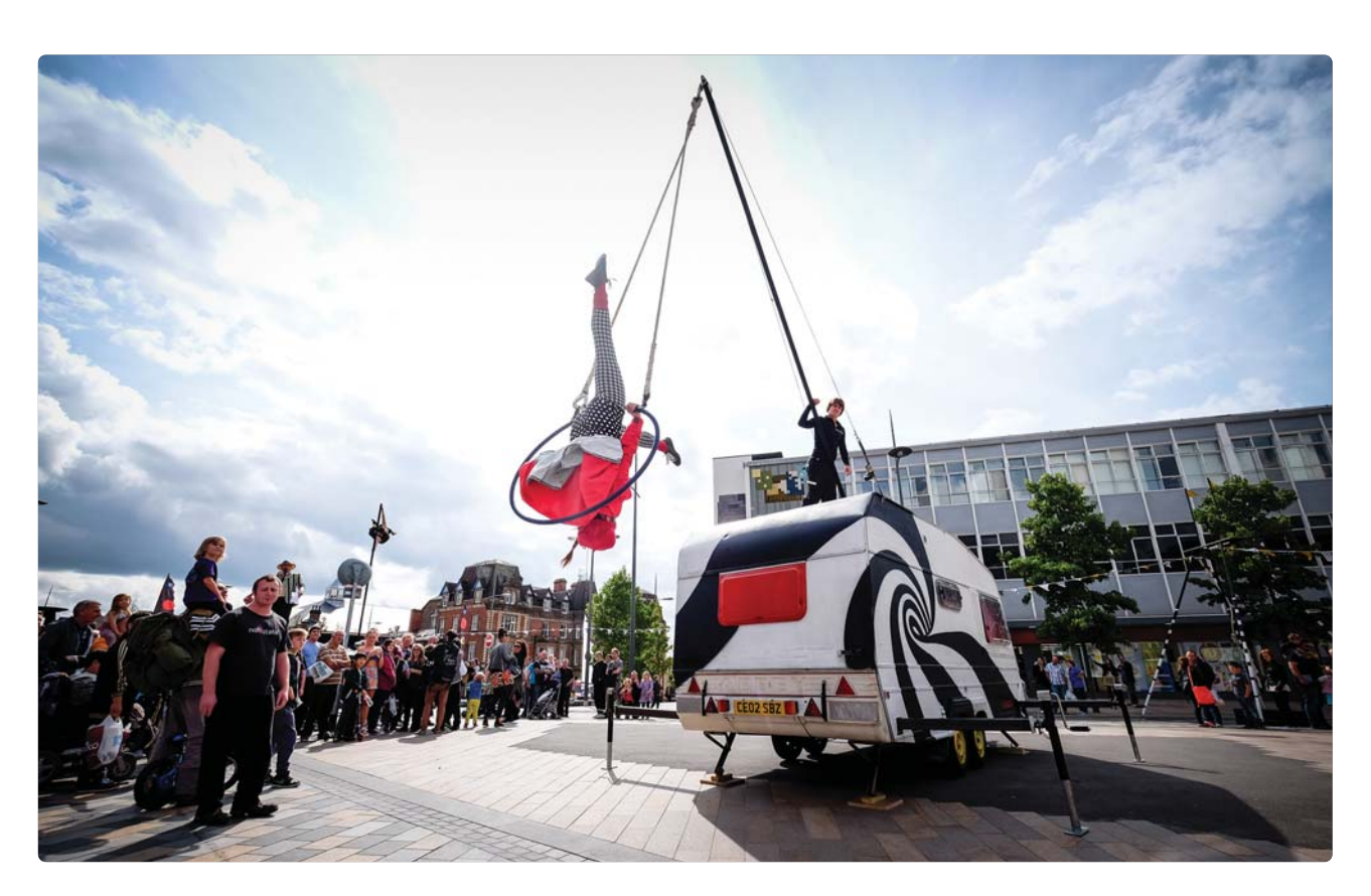
Open House, NoFit State

We look to the future with confidence and conviction. We talk of what we believe in and the things we want to do – of emphasis and priority. We do so in ways that we hope will be welcoming and inclusive, drawing closer those who might share, support and indeed help shape our vision. Because if we do, then just imagine what could be done. Just imagine the Wales, with a little courage, we could then, together, go on to create.